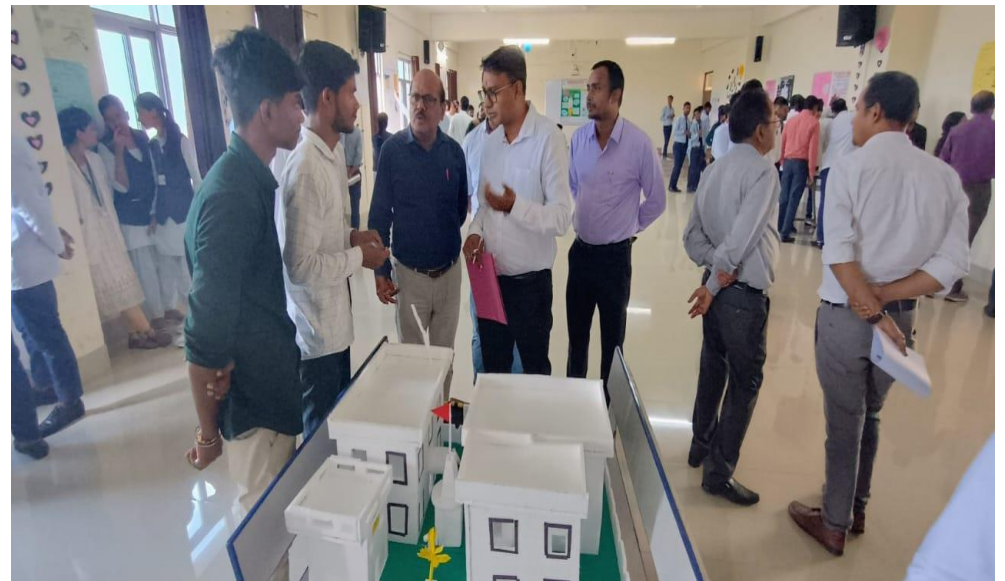
Poster And Model Presentation By Students