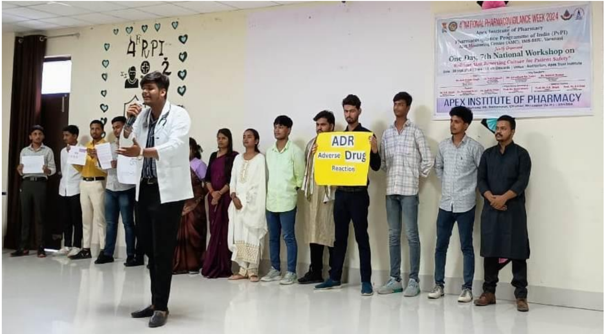
Skit on ADR Awareness Program