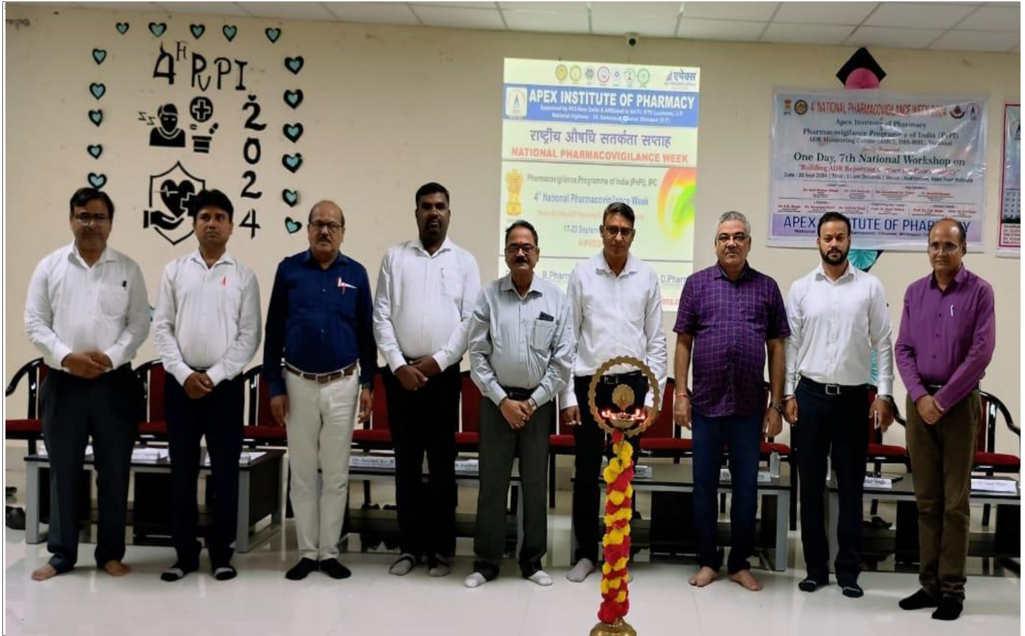
Lamp lighting by dignitaries and delegates